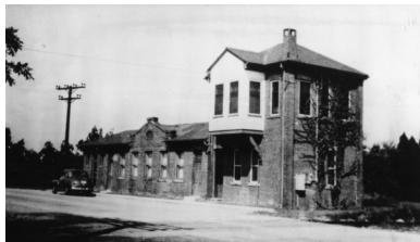
Historic Naval Academy Junction

Adjacent to Walgreen's, regional library and three minutes to MARC train.