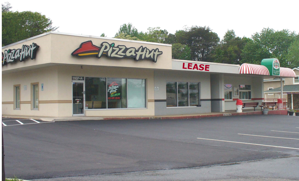
Join Pizza Hut & Rita's Italian Ice!