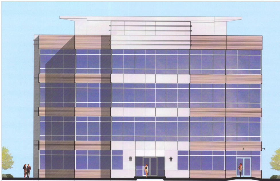
CLASS A OFFICE SPACE IN THE ODENTON TOWN CENTER.

Daytime Population of 169,259 1,200+ residences newly constructed Average HH Income of $117,534 Two miles to Fort Meade-population 138,000